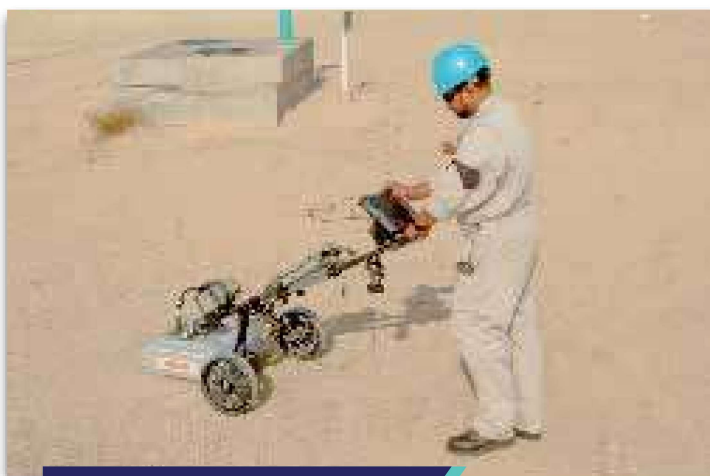
Underground Utility Survey

Project : Topographic Survey and Field Verification for Preparation of a Consolidated Zoning Code and Zoning Regulations and Urban Planning. Client : SSH. Owner : Kuwait Municipality.